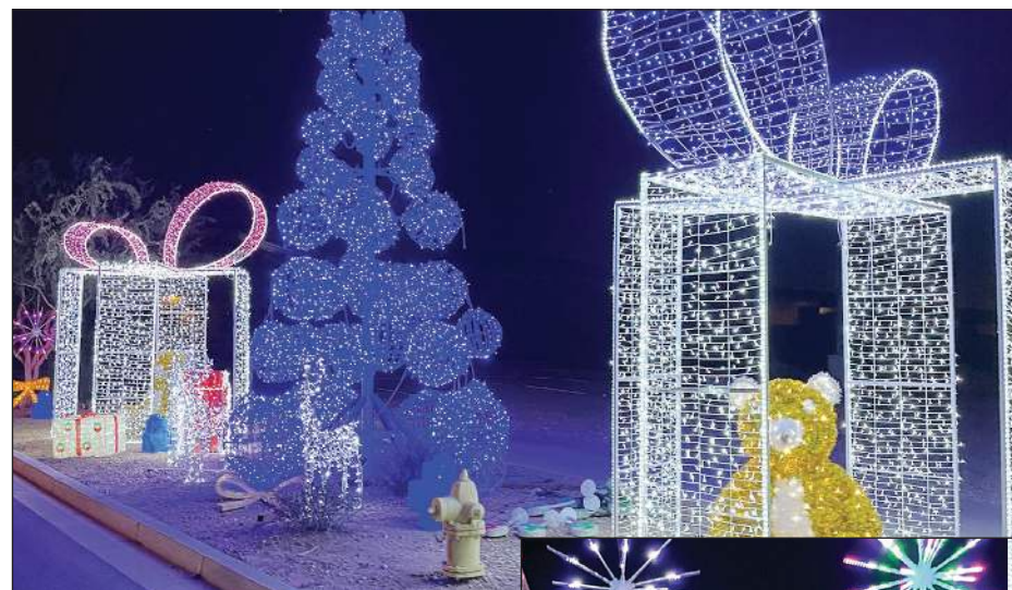
SRPMIC families get the first look at the Holiday Light Experience at Salt River Fields.

BY TASHA SILVERHORN O'odham Action News tasha.silverhorn2@srpmic-nsn.gov