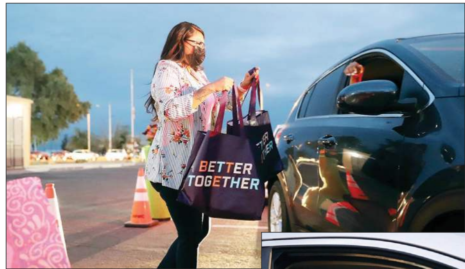
Salt River Seniors receive a goodie bag and hot meal during the drive-thru event Honoring Our Seniors.