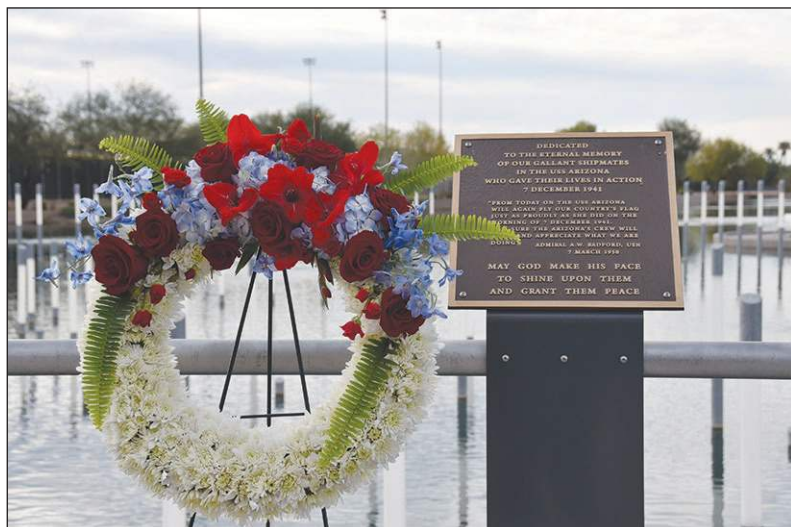
Above: A wreath laid out in front of the USS Arizona Memorial Gardens at Salt River dedication plaque.