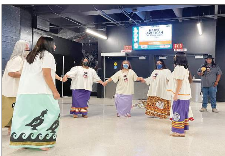
Traditional O’odham Dancers Vah-ki of Gila River perform for the crowd before the game.