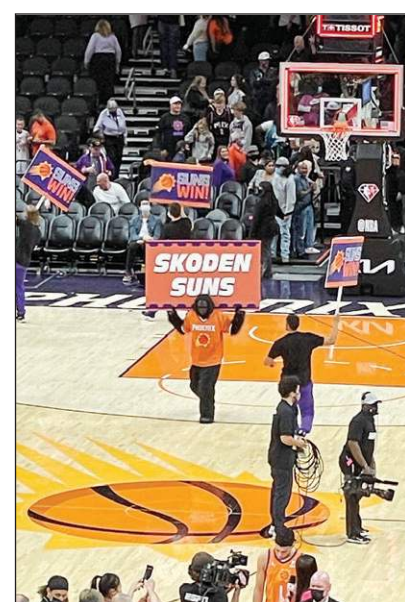
The Phoenix Suns Gorilla holds up a sign that said “Skoden” at the end of the game during the Native American Heritage Night.