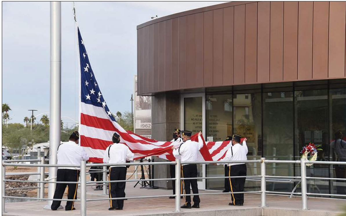
American Legion Bushmaster's Post #114 holds a flag breathing ceremony after a wreath laying ceremony at the USS Arizona Memorial Gardens at Salt River 80th Commemoration National Pearl Harbor Remembrance on December 7.

"With them coming out, I now look forward to their aid and support in future events. Going forward, I think we could utilize this space more at the Veteran's