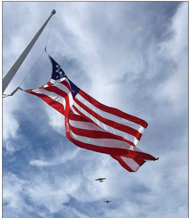
Right: A B-17 Flying Fortress "Sentimental Journey" and C-47 Skytrain "Old Number 30" fly over the USS Arizona Memorial Gardens at Salt River 80th Commemoration National Pearl Harbor Remembrance on December 7.