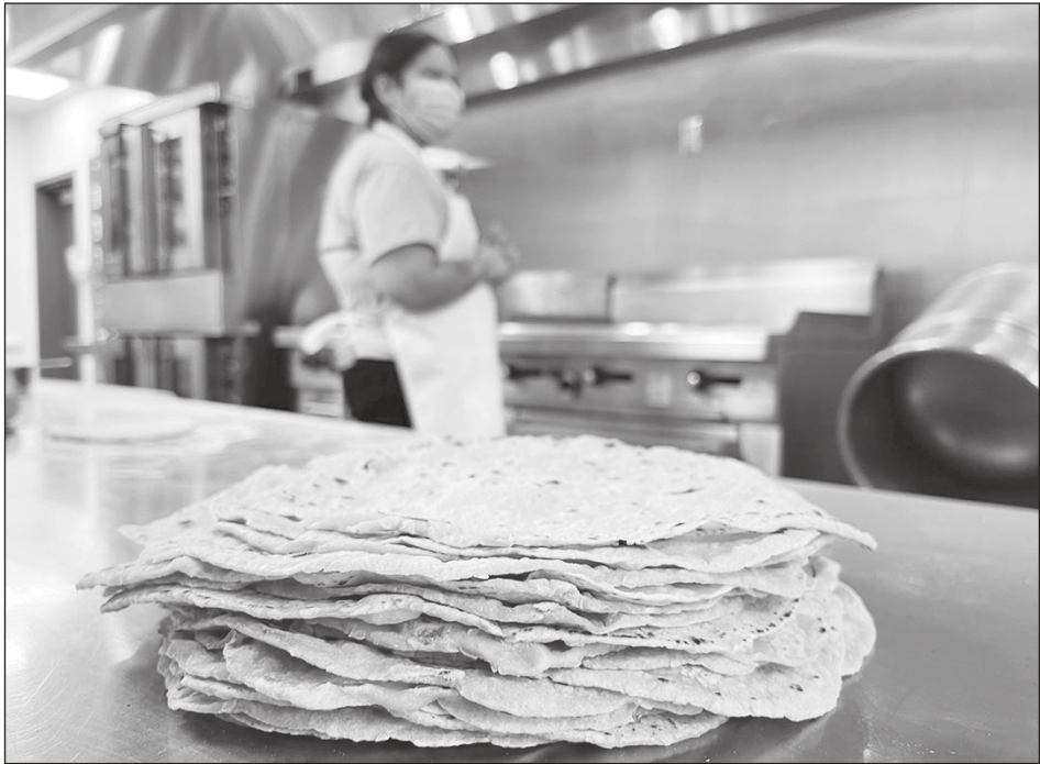
Salt River Schools Food Service’s staff make ce’cemait (tortillas) using traditional ingredients such as white Sonoran wheat.

BY TASHA SILVERHORN O’odham Action News tasha.silverhorn2@srpmic-nsn.gov