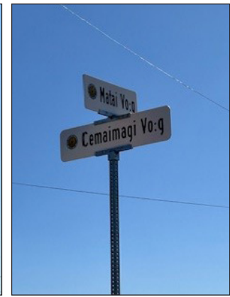
New street signs and maps of where they are placed in the Community.

that they be easy to pronounce, have no special characters and do not exceed a set number of characters due to the space available on street signs.