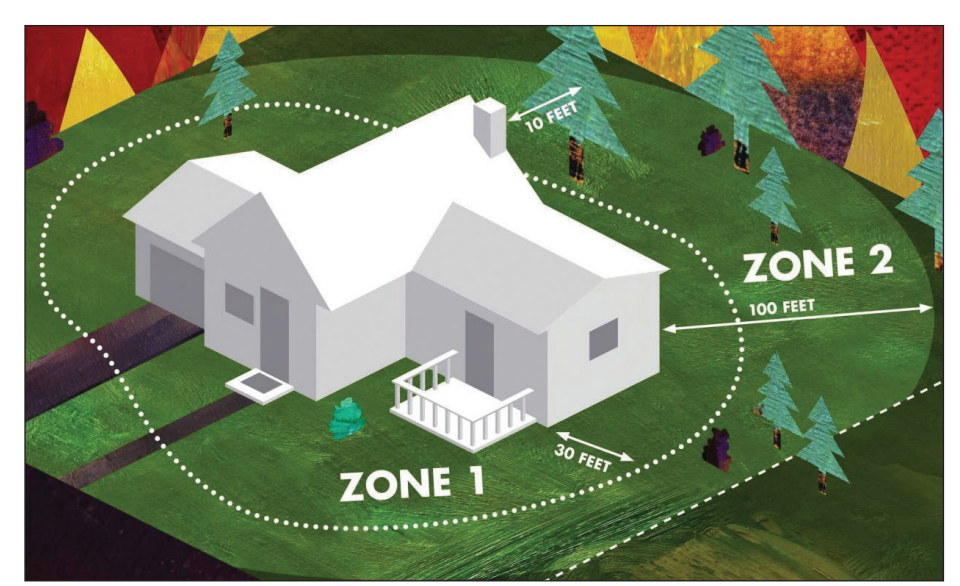
To prevent wildfires, the Salt River Fire Department is aiming for about 30 feet of defensible space (Zone 1) around Community homes.

likelihood of a potentially dangerous wildfire season, we are trying to go out, be proactive and work with other [Community] departments to identify the houses and potentially get [the homeowners] some assistance with cleaning and clearing a defensible space around their residence," said Scabby.