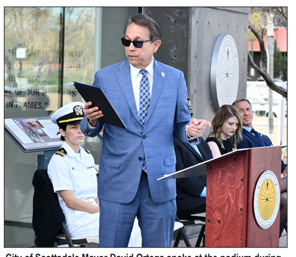
City of Scottsdale Mayor David Ortega spoke at the podium during the ceremony and named Old Town Scottsdale as an official "Port of Call" for the Naval Academy.