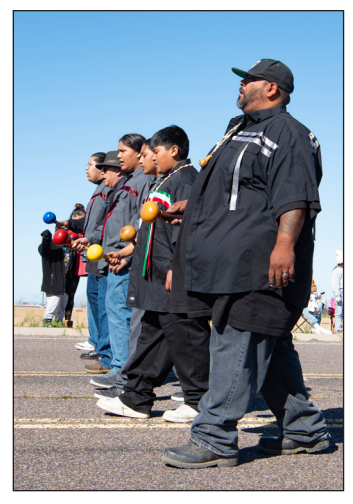
Birds Singing and Dancing by the River.