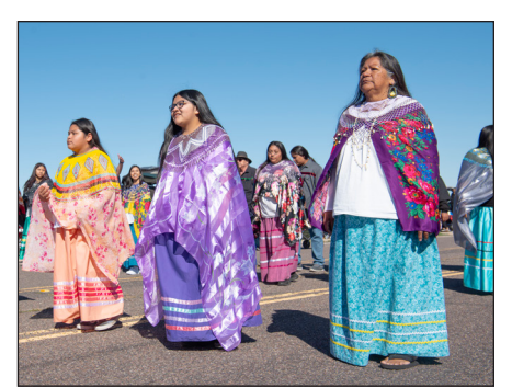
Birds Singing and Dancing by the River.