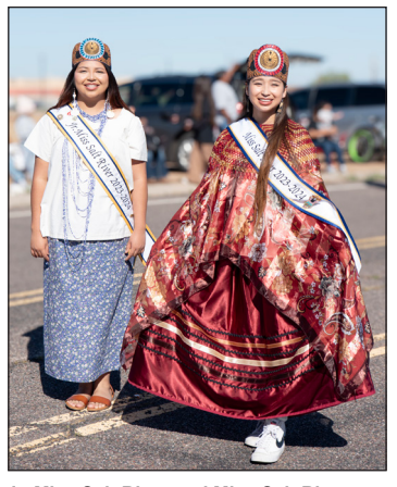
Jr. Miss Salt River and Miss Salt River.