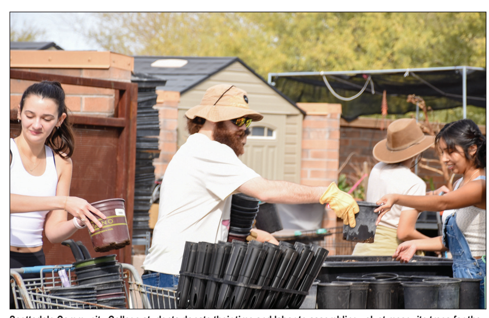
Scottsdale Community College students donate their time and labor to assembling velvet mesquite trees for the