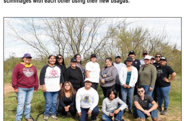
The participants in the class smile after completing the three part toka series.

The goal of the game is to hit the o'da across the team's goal line. Positioned on opposite sides of the