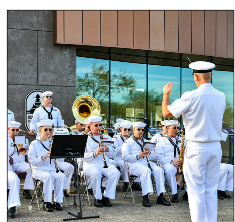
The Navy Band Southwest performed a medley of patriotic tunes as guests arrived to the ceremony.

Navy Week will continue making stops throughout the year. After the visit to the USS Arizona Memorial Gardens,