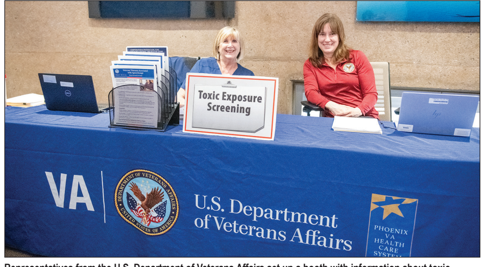
Representatives from the U.S. Department of Veterans Affairs set up a booth with information about toxic exposure screenings at the Veteran's Open House.

A total of 13 vendors had booths at the event, including the U.S. Department virtually with your VA provider, adapt to