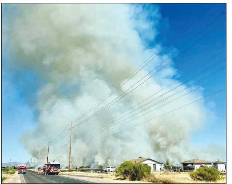
A couple summers back, Salt River Fire Department responded to a growing fire approaching Community homes.

You can read the information there or download the handy fact sheet: How to Prepare Your Home for Wildfires.