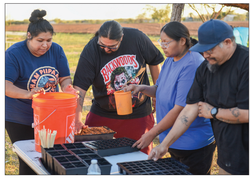
Participants of the Native Plants class filled seed starter trays with a mixture of soil, manure, and flower seeds.