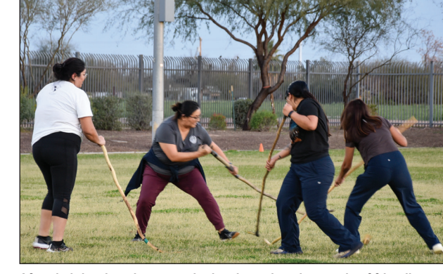
After their hard work, women in the class played a couple of friendly scimmages with each other using their new usagas.