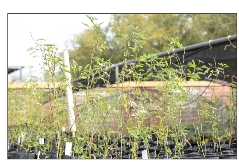
The 50 prepared mesquite trees will be sprouted in time to plant during the SRPMIC Earth Day celebration in April.

the last group was left in its natural state.