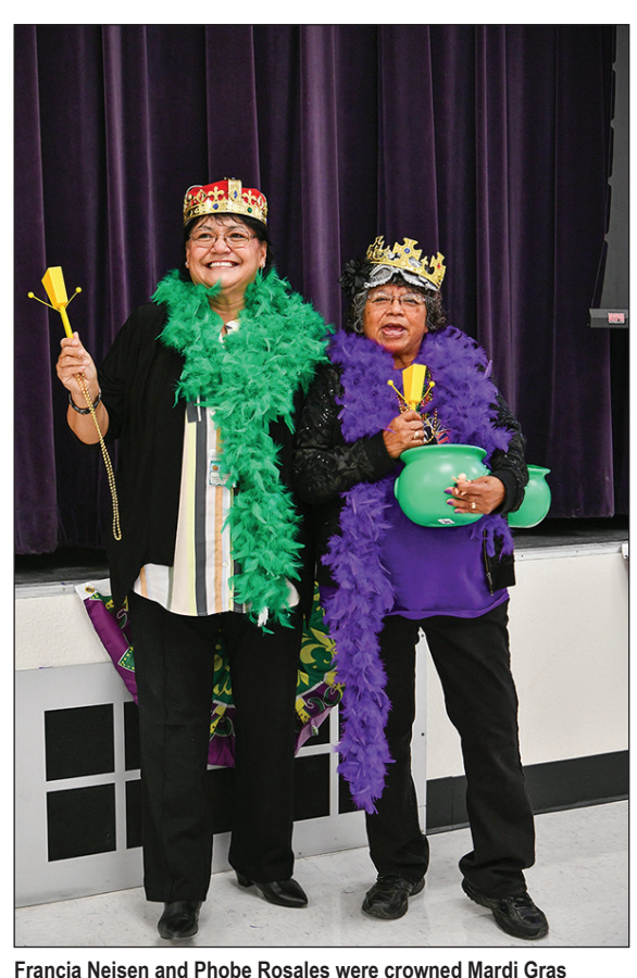
royalty as they were the winners who found the tiny baby inside of the baked goods served at the Senior breakfast.