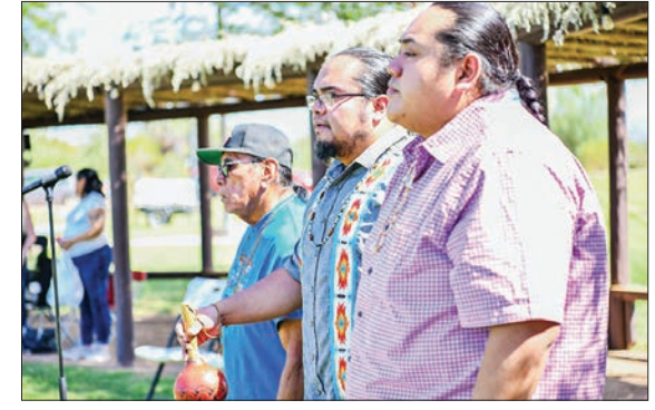
The Hualapai Bird Singers from Peach Springs, Arizona performed traditional Bird songs during the morning festivities.