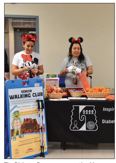
The Diabetes Program gave out healthy snacks and information about some of the programs they offer.