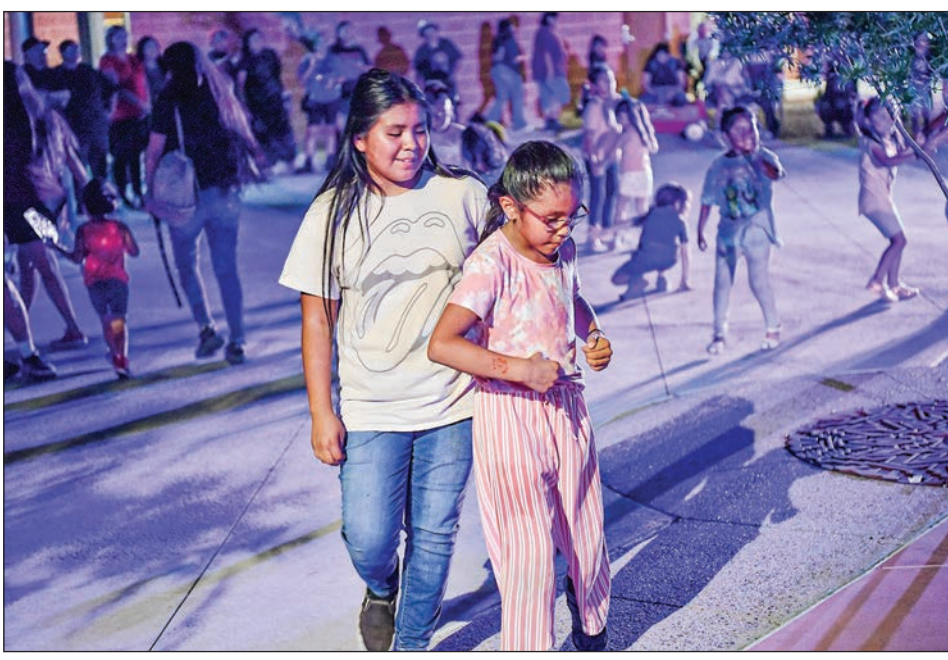
The night's festivities came to an end with a cumbia contest.