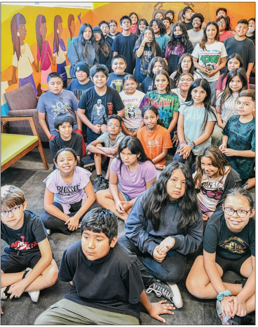
TOP: The artists assembled together for the group photo to celebrate the completion of their mural.

BOTTOM: The completed mural as it stands inside of the Defense Attorney's Office inside of the Salt River Pima-Maricopa Indian Community Justice Center.