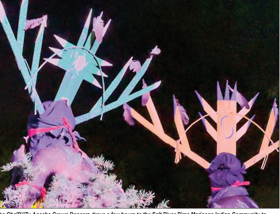
The Cha'Bii'Tu Apache Crown Dancers drove a few hours to the Salt River Pima Maricopa-Indian Community to perform during the annual NARD celebration.

also featured appearances by Junior Miss