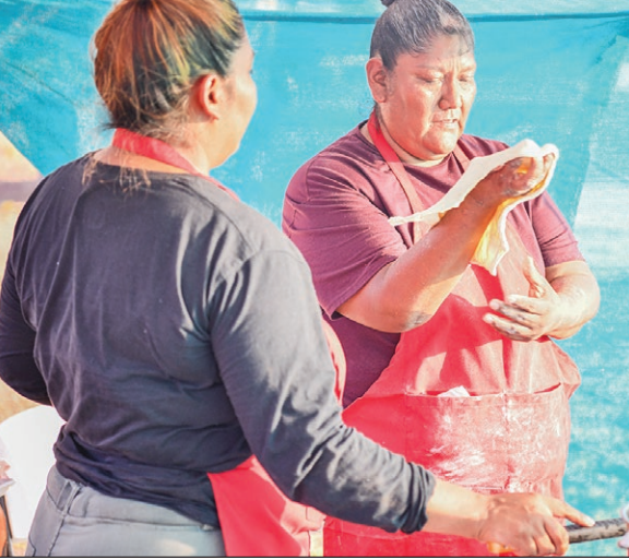
During dinner, the line to get frybread went around the food vendor booths and stretched all the way towards the free water station.