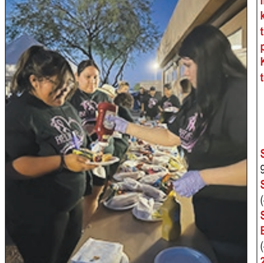
Following the walk, participants were treated to a meal.

If you or anyone you know is experiencing thoughts of suicide, please refer to these Keepsafe Connection telephone numbers: