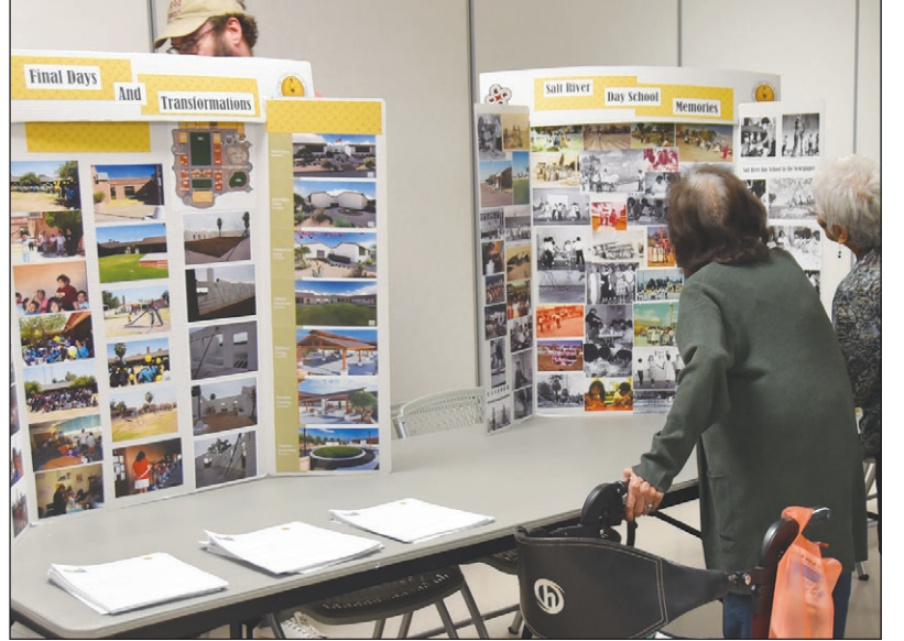
Seniors look at Salt River Day School memories provided by the Cultural Resources Department.

Other departments and programs with information booths at the breakfast were the Senior Home Repair and Replacement Program (SHRRP), River People Health Center Nutrition Services, CDD/EPNR Household Hazardous Waste, and Diabetes Prevention Services.