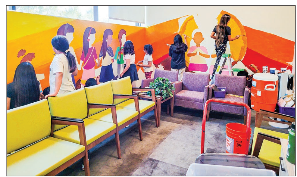
Spending their time after school to paint, the artists collaborated on the design, color, and theme while also making sure everyone participated in painting the mural.

On the west wall, the children painted two O'odham women dressed in traditional clothing on their knees praying while a traditional basket rests behind them in th