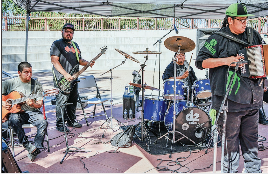
At the conclusion of the walk, Native Thunder performed in the Two Waters Courtyard.