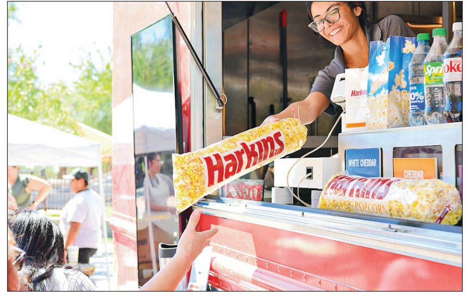
As Community members and SRMPIC staff grabbed their free movie popcorn, others decided they needed just a bit more of the delicious snack. Harkins Theaters' food truck sold additional bags of popcorn and snacks.

Plans for the 2024 NARD celebration have already begun, and the first task is to select a larger location due to this year's turnout.