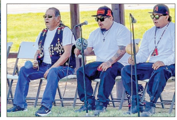
The Piipaash Bird singers sang traditional songs throughout the social.