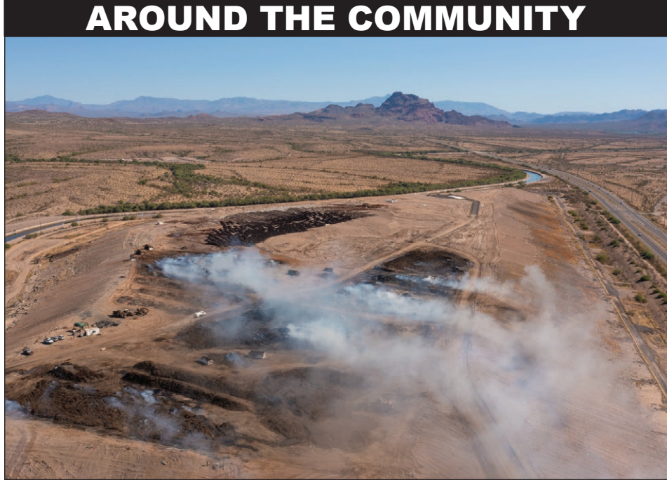
On Saturday, September 30, a green waste fire broke out at the Salt River Landfill. The fire was immediately contained, however it continued to smolder for almost a week. Landfill personnel, supported by multiple departments and agencies, worked around the clock to extinguish all smoldering by Friday, October 6. There was no immediate threat to public safety at any time but concerns over air quality remained and residents were encouraged to take precautions.