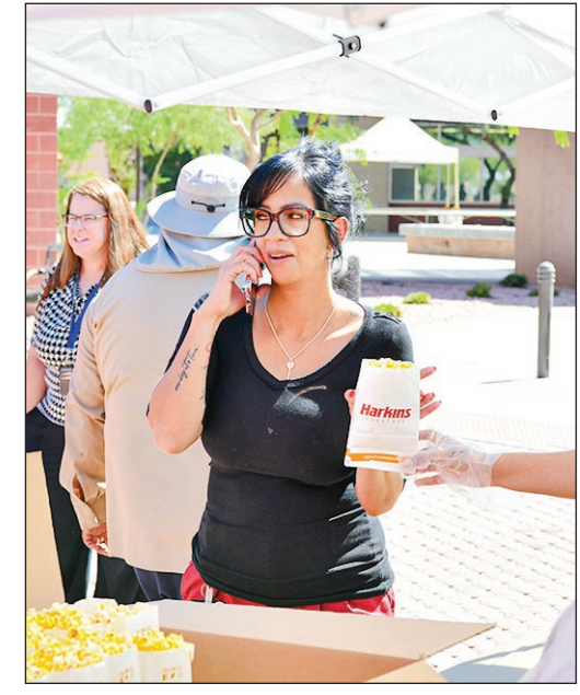
Free bags of Harkins movie theater popcorn were handed out to Community Members and Salt River Pima-Maricopa Indian Community employees.

As the celebration continued inside, the multitalented indie rock band One Way Sky performed during lunchtime inside the Round House Café. "We're just here [playing]