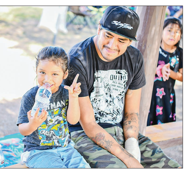
It was all smiles during the Piipaash Matasheevm Social as there were free water, goodies, games, and fun for everyone of all ages.

Though not as big as the spring celebration held in April, the fall social celebration proved to be yet another fantastic get-together of intertribal veterans, Council members, royalty, dancers, singers and families.