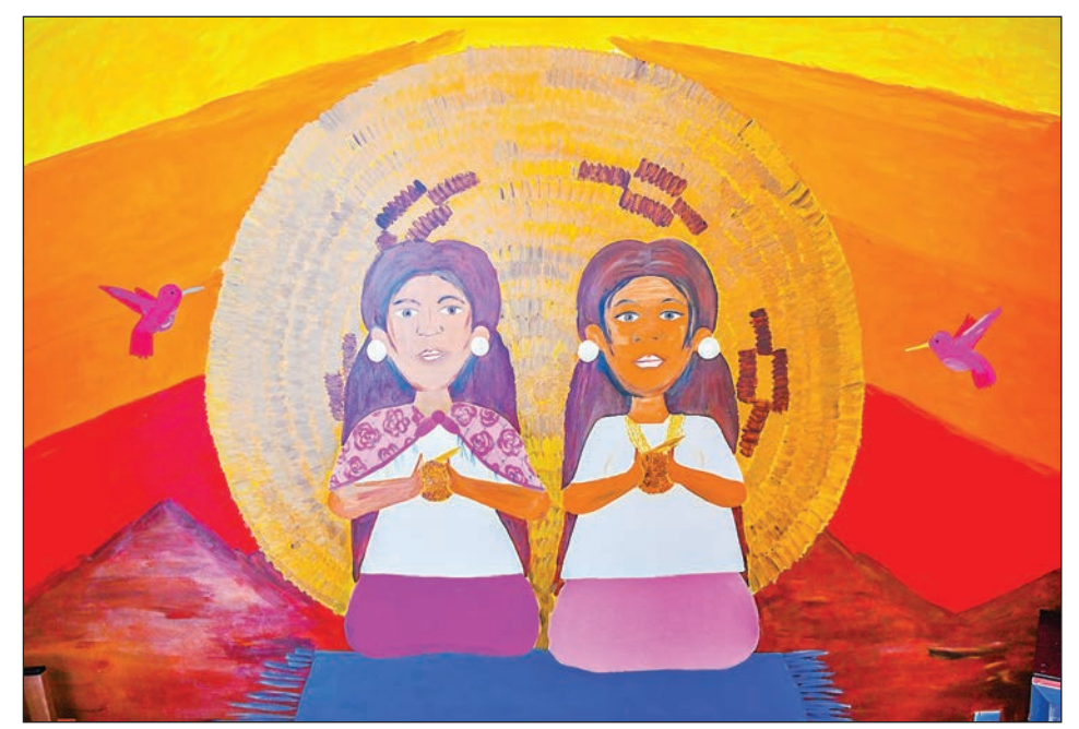
On the west wall, two women pray while wearing traditional dresses and earrings as a traditional basket rests behind them.