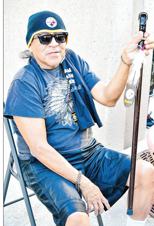
Participants lined up in the early morning to check-in and recieve their free t-shirt.