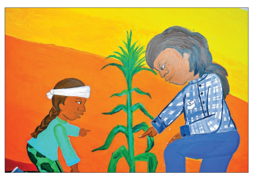
On the north side of the wall, a Mother helps tend to her corn with her daughter in their garden.