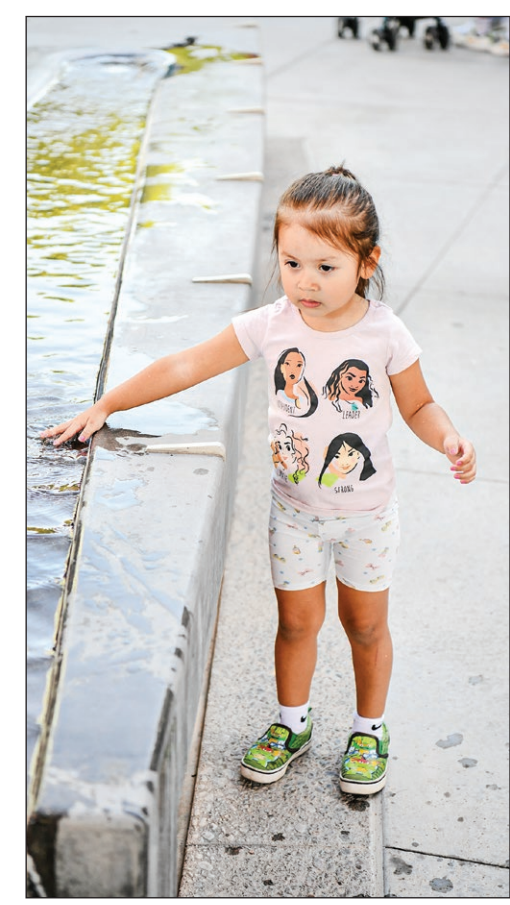
This little girl cooled off in the water display before the walk started.