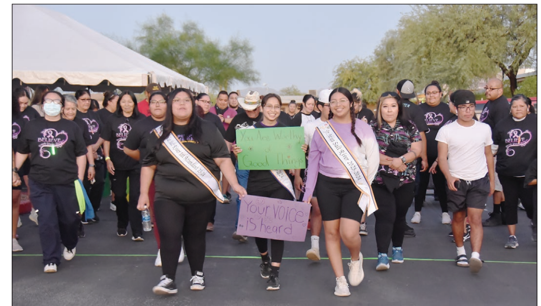
Salt River Royalty leads the Glow Walk.

Members of the SRPMIC Royalty led the way as the walk began at 6 p.m. The route took the group of walkers, who were wearing glow sticks and carrying supportive signs, around the Two Waters complex and back to the Fitness Center, where they rested and ate a meal before heading home.