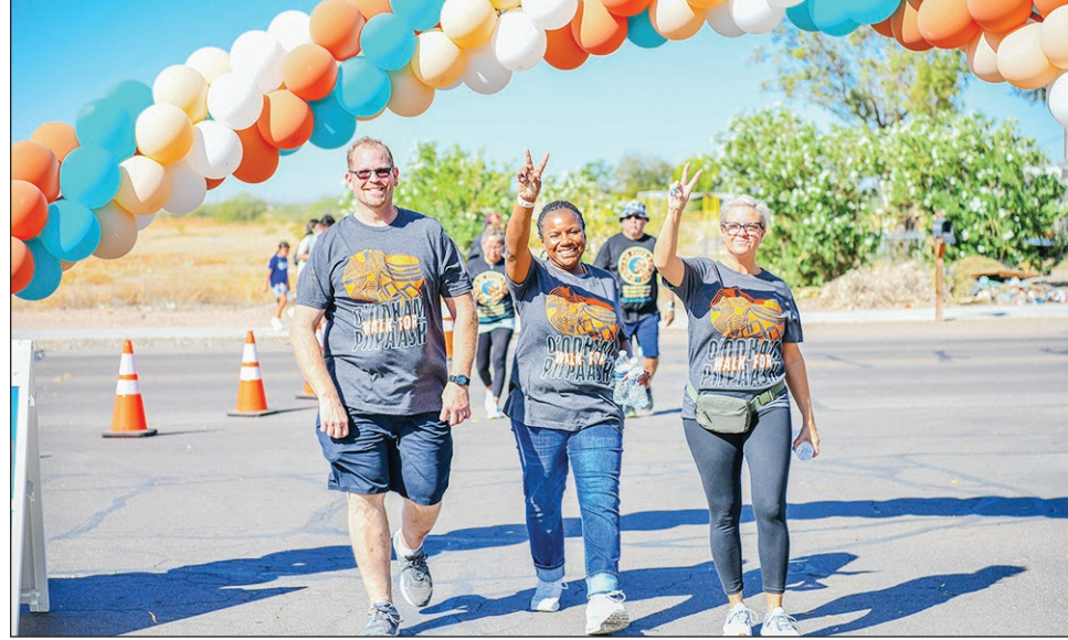
The first 500 participants to sign up for the event received a free Walk For O'odham Piipaash T-shirt.