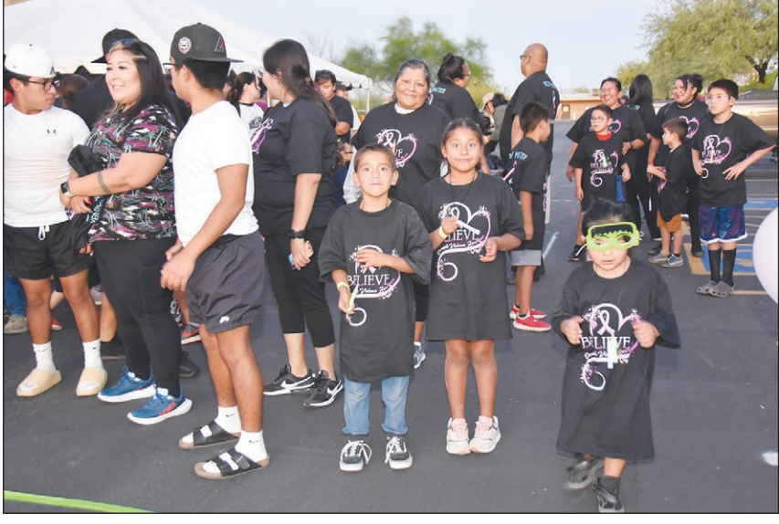
Participants wait for the signal to begin the Glow Walk.