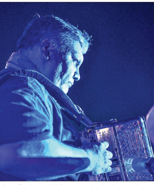
The Lopez Band played chicken scratch classics that caused everyone to rush the dance floor.

In the heart of the Two Waters Courtyard complex, the 2023 NARD celebration kicked off with a two-part celebration. For the daytime festivities, Harkins Theatres parked their food truck and handed out individual