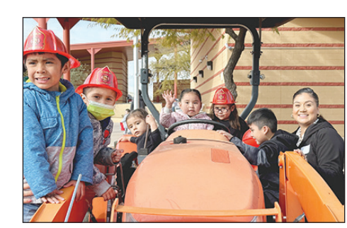
Students and faculty pose for a photo on a tractor outside of ECEC on Big Wheel Day.