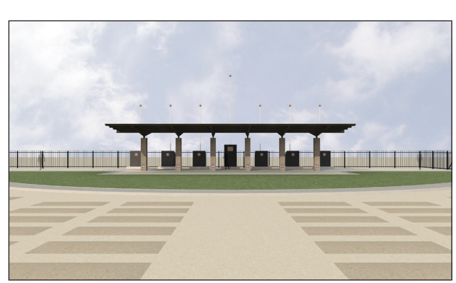
Conceptual front view of the Lehi Veterans Memorial.

designate a veterans' area with a dedicated memorial or service feature for gathering.