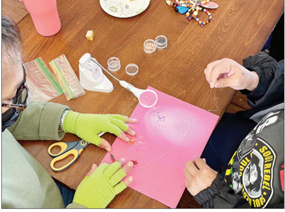
Seniors in the zone, learning how to make beaded earrings.