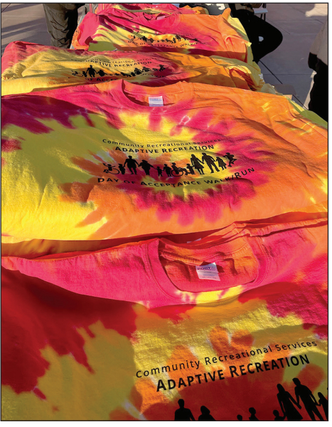
T-shirts and other incentives were given to the first 125 participants.