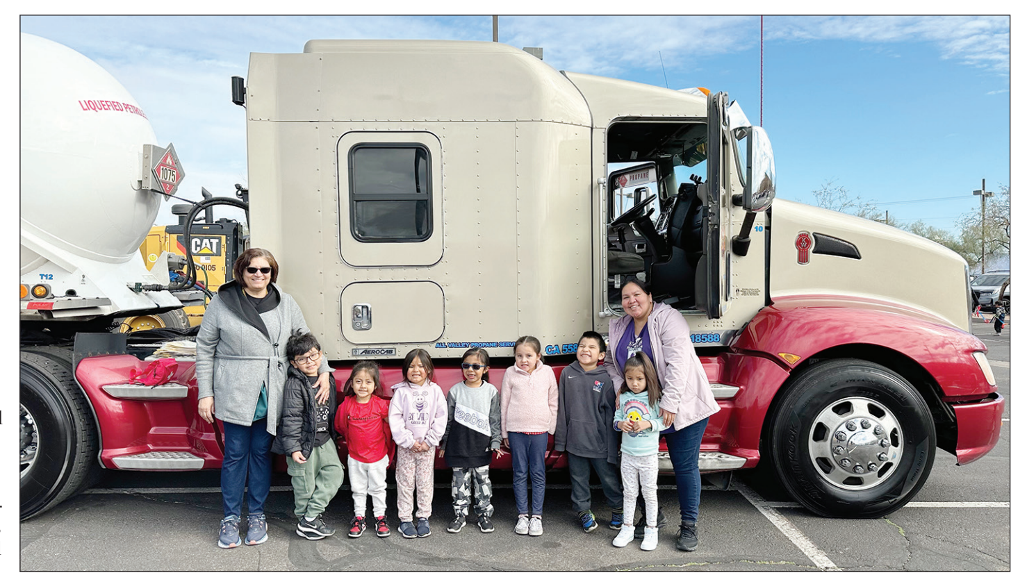
Students and faculty line up in front of a large propane truck on Big Wheel Day

"ECEC views this year's Big Wheel Day as a great success, because there was an increase in family participation