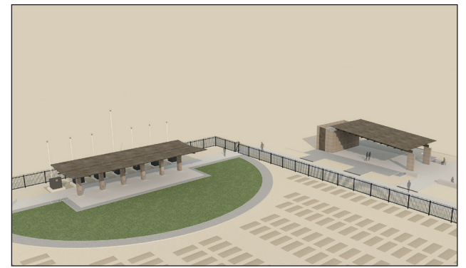
Conceptual aerial view of the Lehi Veterans Memorial.

Community veterans have talked about building cemetery memorials since the 1980s. Public Works started the collaboration with a preliminary master plan of the Community's cemeteries in the fall of 2020. The master planning was necessary to use space more efficiently and to expand the cemeteries for future use. The veterans group expressed a need to