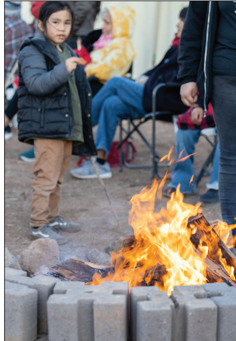
Top: Listeners bundled in jackets and blankets, to try their best to stary warm. Above: Community members gather around the fire, during winter storytelling.

Lewis said the stories are also told starting at sunset and can go all the way to sunrise over the course of a couple of days, often four days. Throughout the course of the evening, Lewis would recite parts of the story in English and then go back over in O'odham ñiok to reaffirm the oral traditions spoken in the language of the Community.