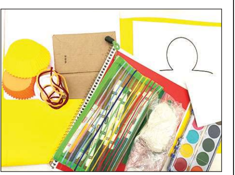
A kit that students will use for various activities with the Children's Resiliency Group.

To participate in the Children's Resiliency Group, families should contact BHS at (480) 362-5707 to enroll. Students who are not currently enrolled in BHS services can schedule an intake appointment to enroll in the group.